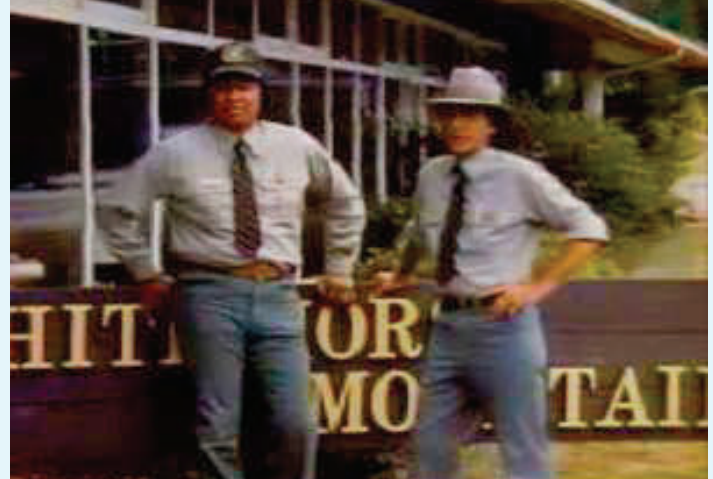
In 1980, the DCC was used for the Whitehorse Mountain Lodge in the film High Ice (NBC/ESJ Productions).

The donation will go towards DCC building maintenance to keep it in working order. Built in 1954, the DCC has brought much joy to the residents in Darrington throughout the generations. A special place for sporting events, after school activities, local donation drives, and more, the DCC is a cherished place to people of all ages. It even starred in a film from 1980 called High Ice (see picture to the right)!